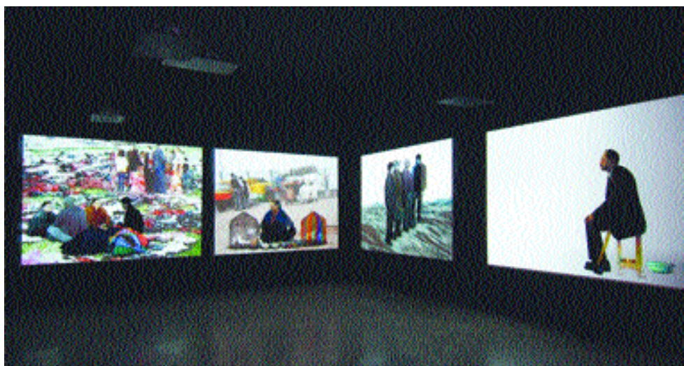
CROSSINGS 2005 4 channel video projection on 190 x 250cm acrylic paintings, 15 minute loop with sound Installation still from Hungry God-Indian Contemporary Art , Arario Gallery, Beijing Sep 3 - Nov 15 2006