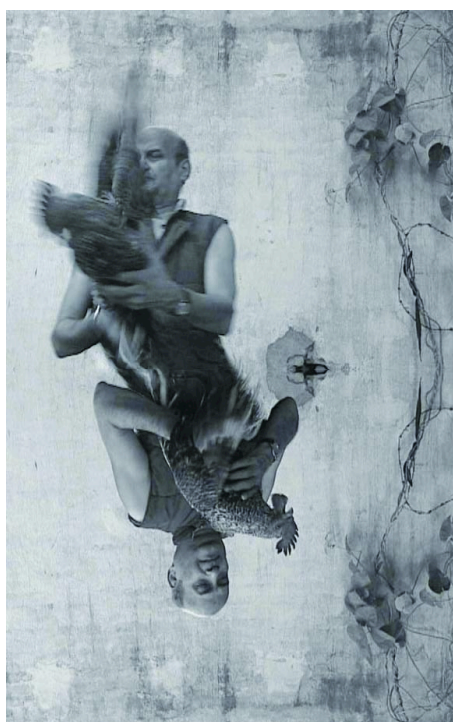
MAN WITH COCKEREL 2001-02 2 channel video, 19 minute loop